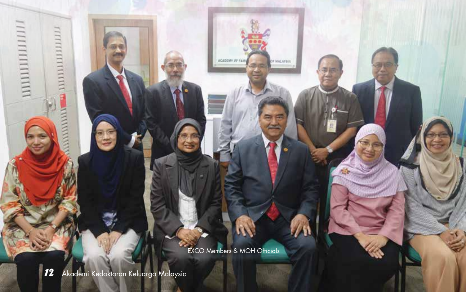
EXCO Members & MOH Officials